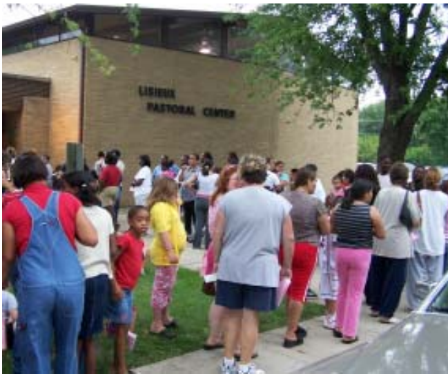
At left, Lines were long as hundreds of youth and their parents came out to the Catholic Charities Back to School Fair held last month at the Lisieux Center in Kankakee.